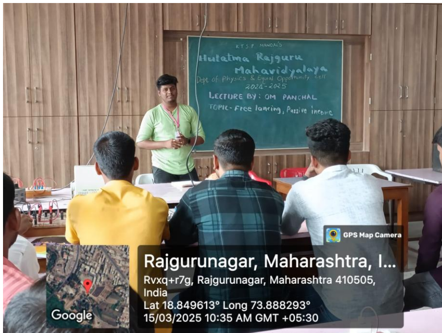
Photo 4. Lecture on Free lancing and Passive income Date: 15/03/ 2025, Strength:53 EOC, Hutatma Rajguru Mahavidyalaya