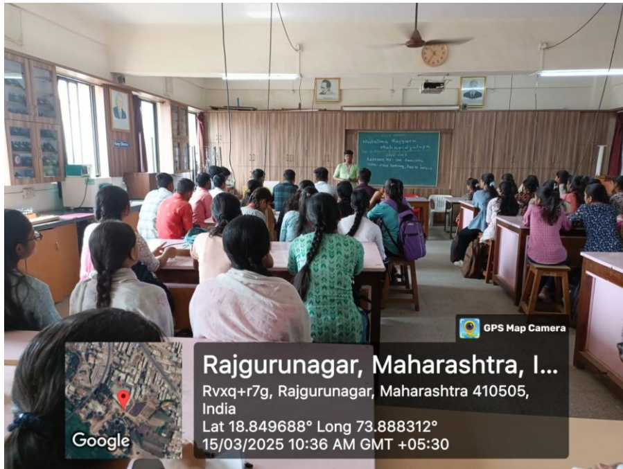
Photo 3. Lecture on Free lancing and Passive income Date: 15/03/ 2025, Strength:53 EOC, Hutatma Rajguru Mahavidyalaya