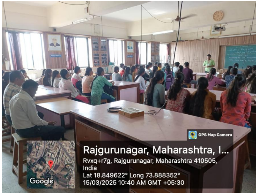
Photo 1. Lecture on Free lancing and Passive income Date: 15/03/ 2025, Strength:53 EOC, Hutatma Rajguru Mahavidyalaya