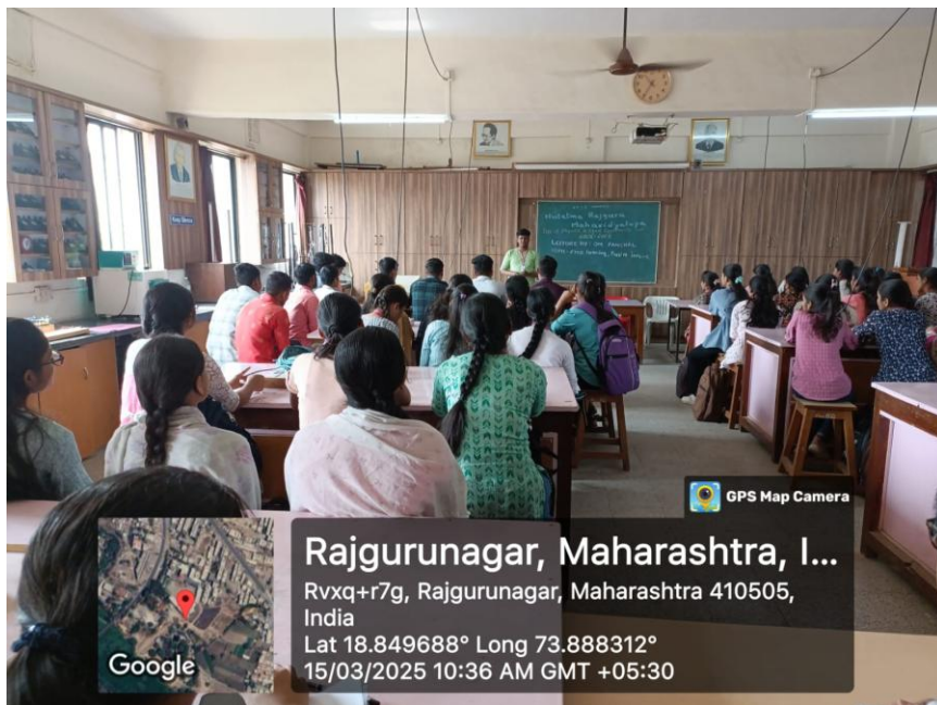
Photo 2. Lecture on Free lancing and Passive income Date: 15/03/ 2025, Strength:53 EOC, Hutatma Rajguru Mahavidyalaya