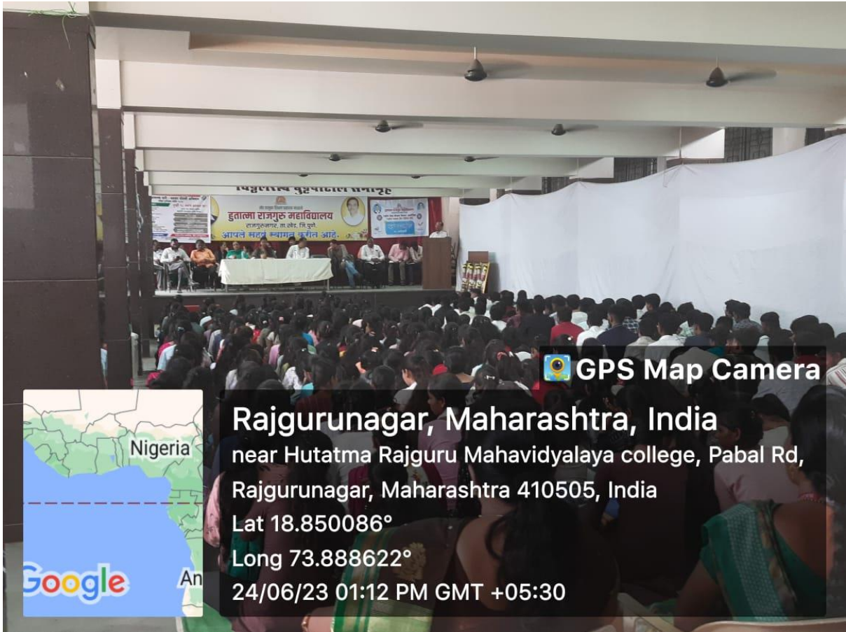
NSS volunteers while attending voter registration campaign