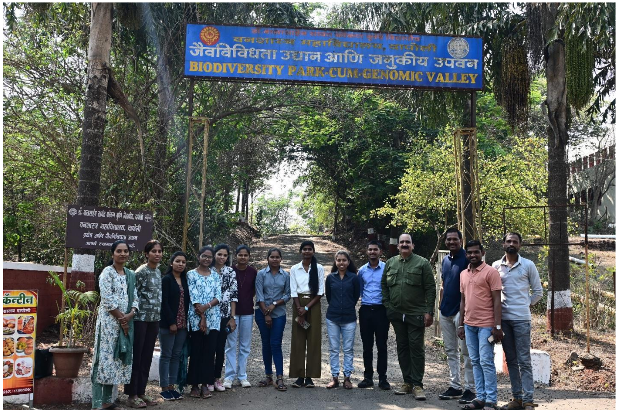
Photo 2: Visit to Biodiversity Park and medicinal garden at Dr. Balasaheb Sawant Konkan Krishi Vidyapeeth, Dapoli.