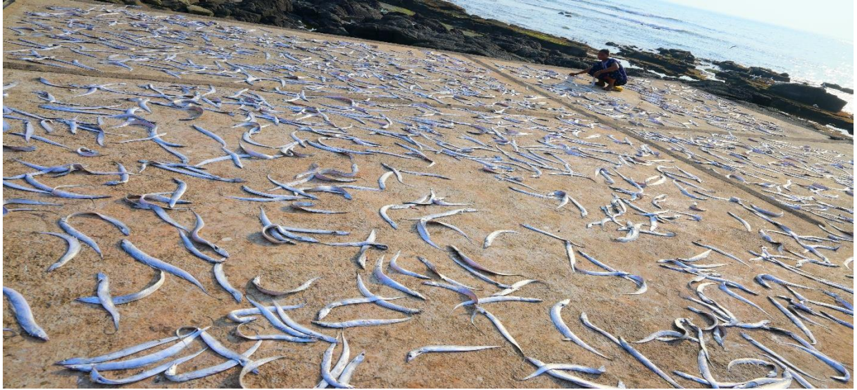
Photo 3:- Marine fishes and fish preservation techniques which practice by the local fisherman.