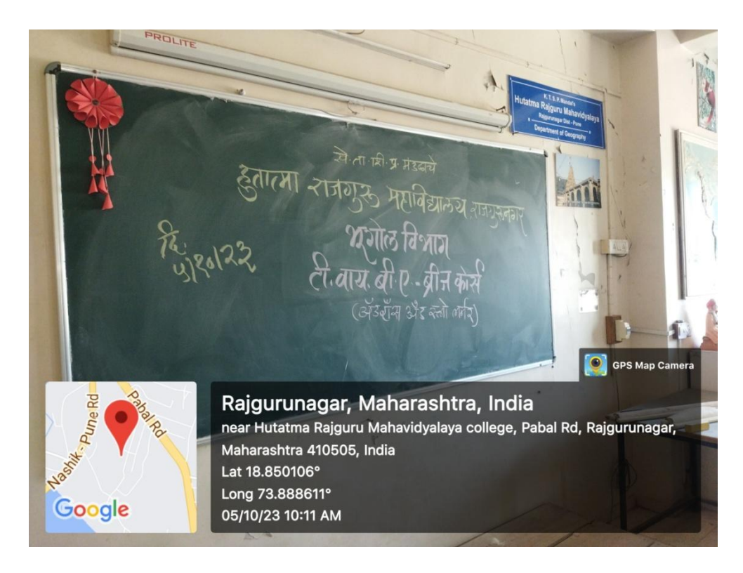
Black Board of Activity