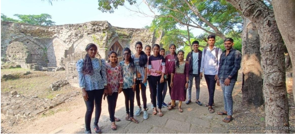
Students of Geography Department at Shivneri Fort.