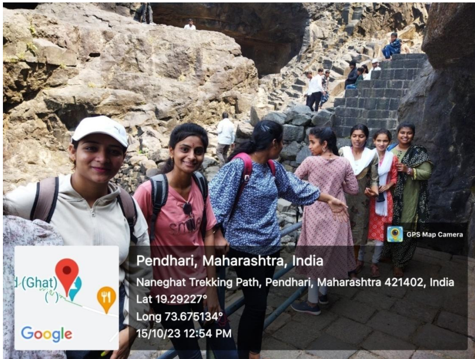
Students at outside of Naneghat Cave