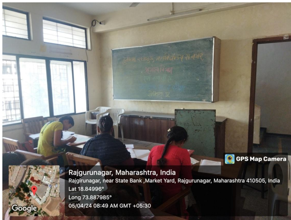
Students Participant in Practical Examination