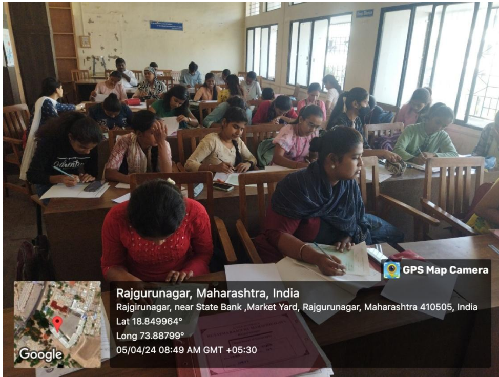
Students Participant in Practical Examination