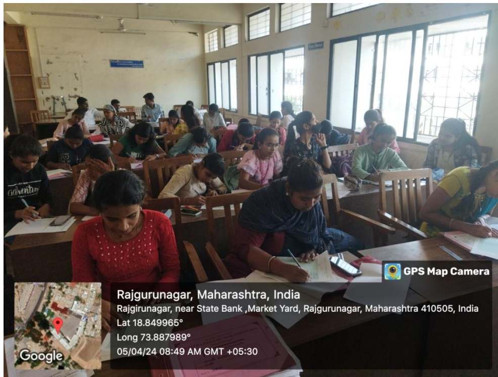
Students Participant in Practical Examination