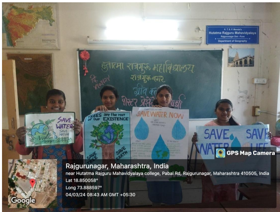
Students in Poster Presentation