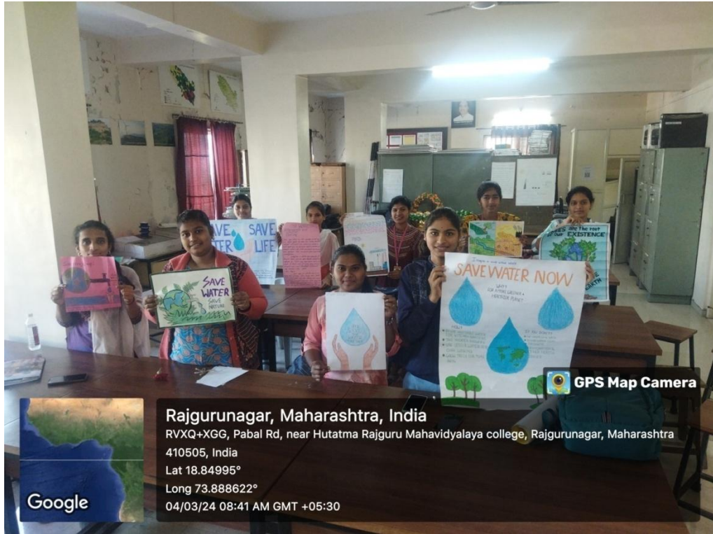
Students participant in competition