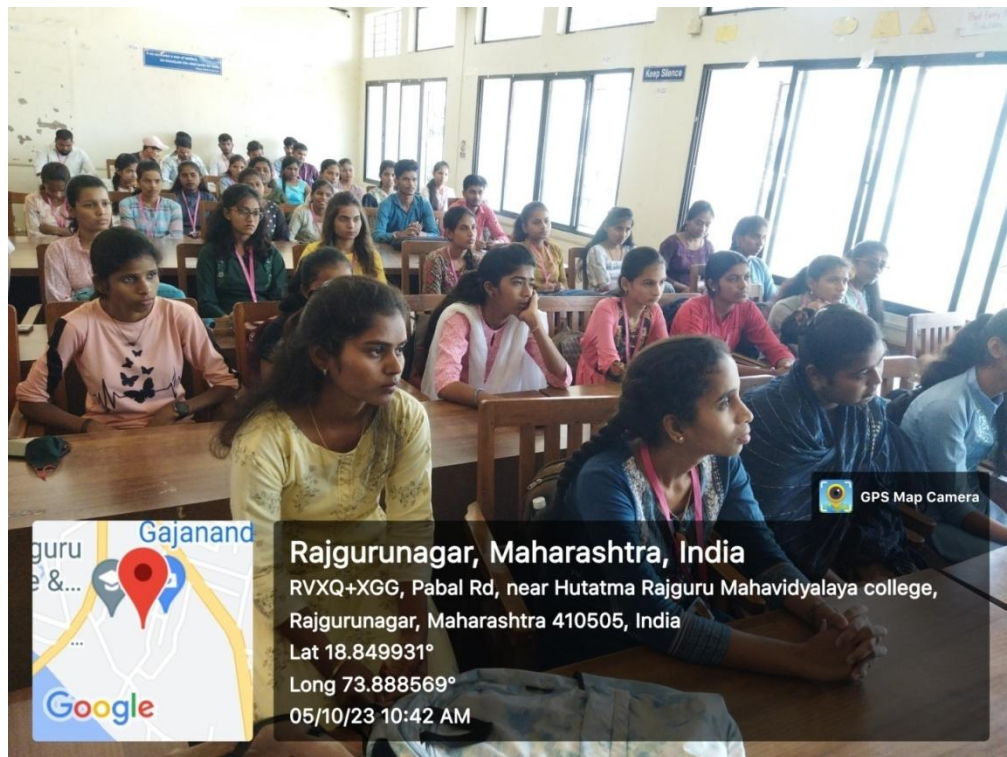
Students in Guest Lecture