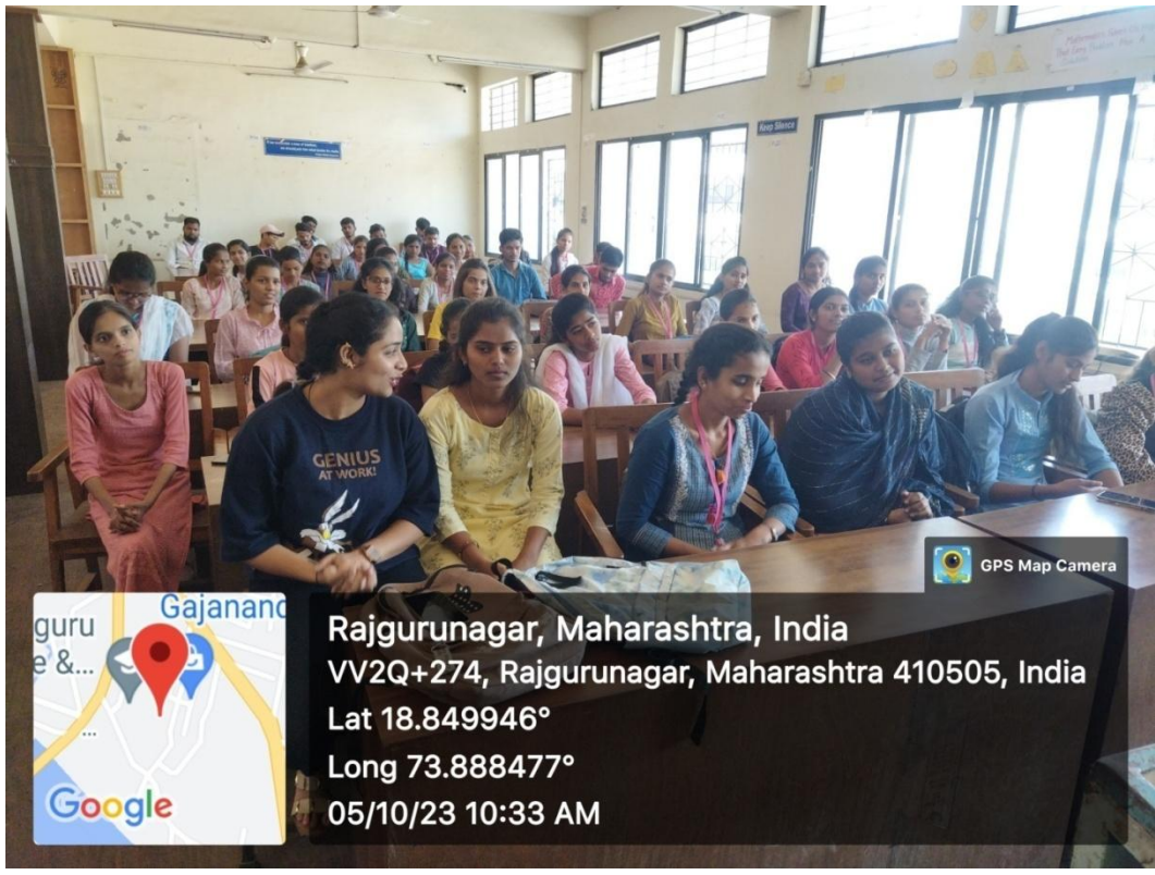
Students in Guest Lecture