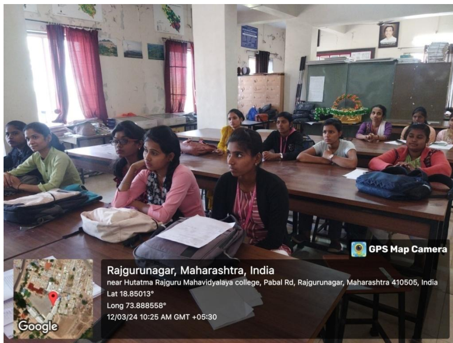
Students in Program