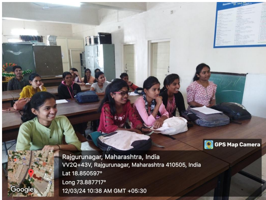
Students in Group Discussion