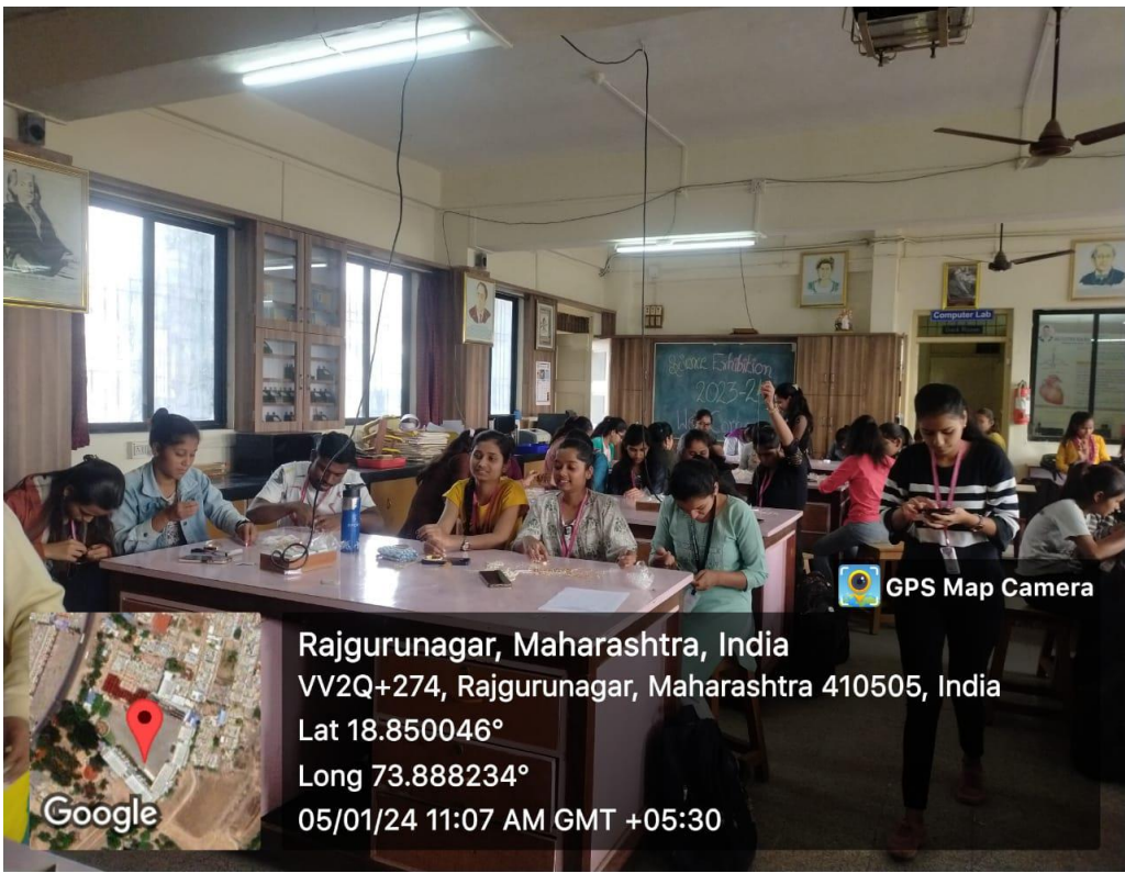
Figure 8: Jewellery Making Workshop