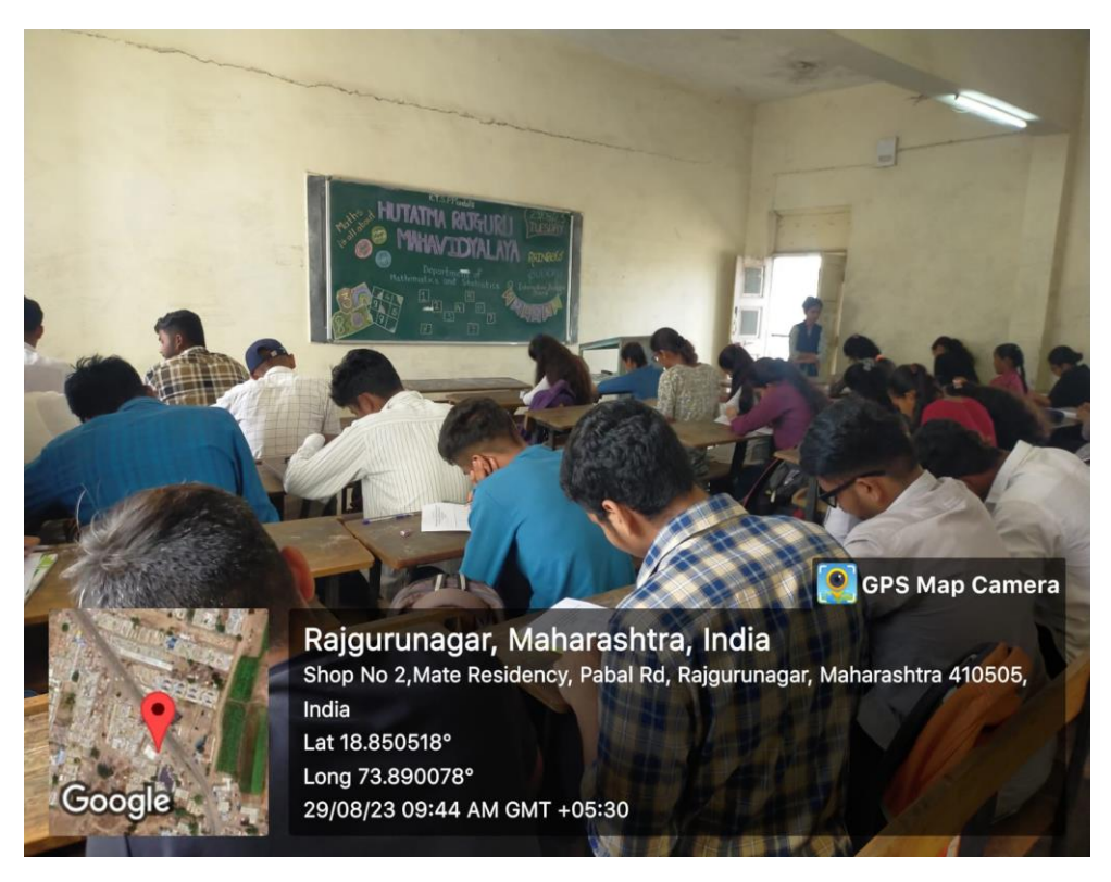
Figure 4: Sudoku Competition