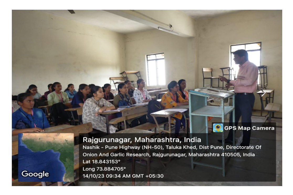
Figure 6: Guest Lecture