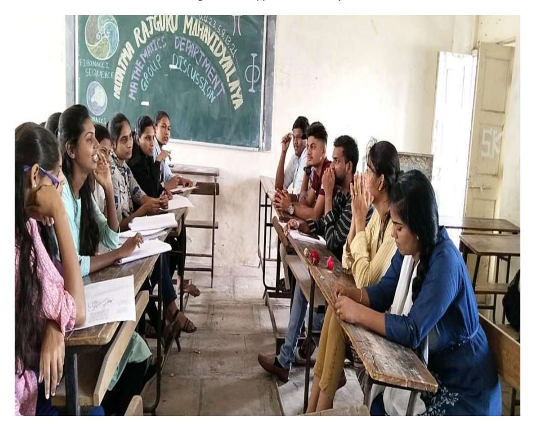
Figure 2: Group Discussion