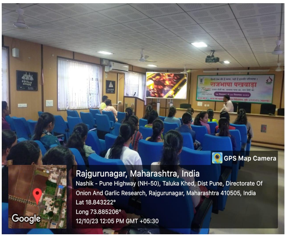
Figure 5: Field Visit