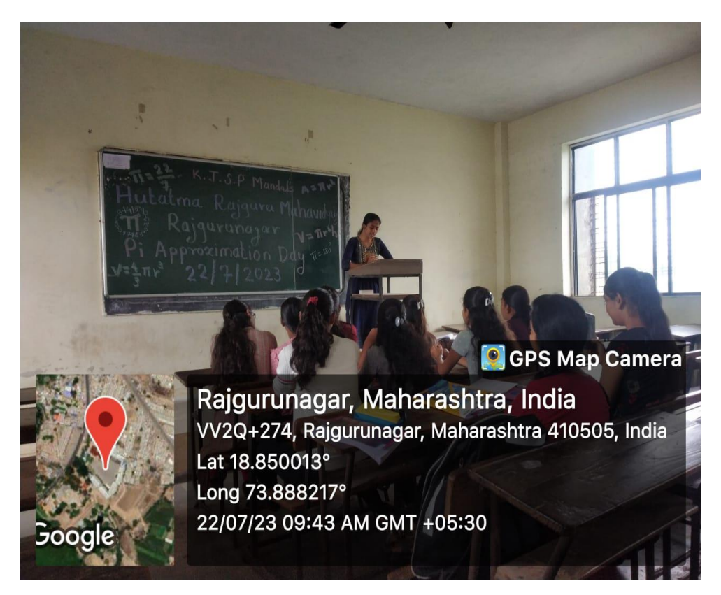
Figure 1: Pi Approximation day