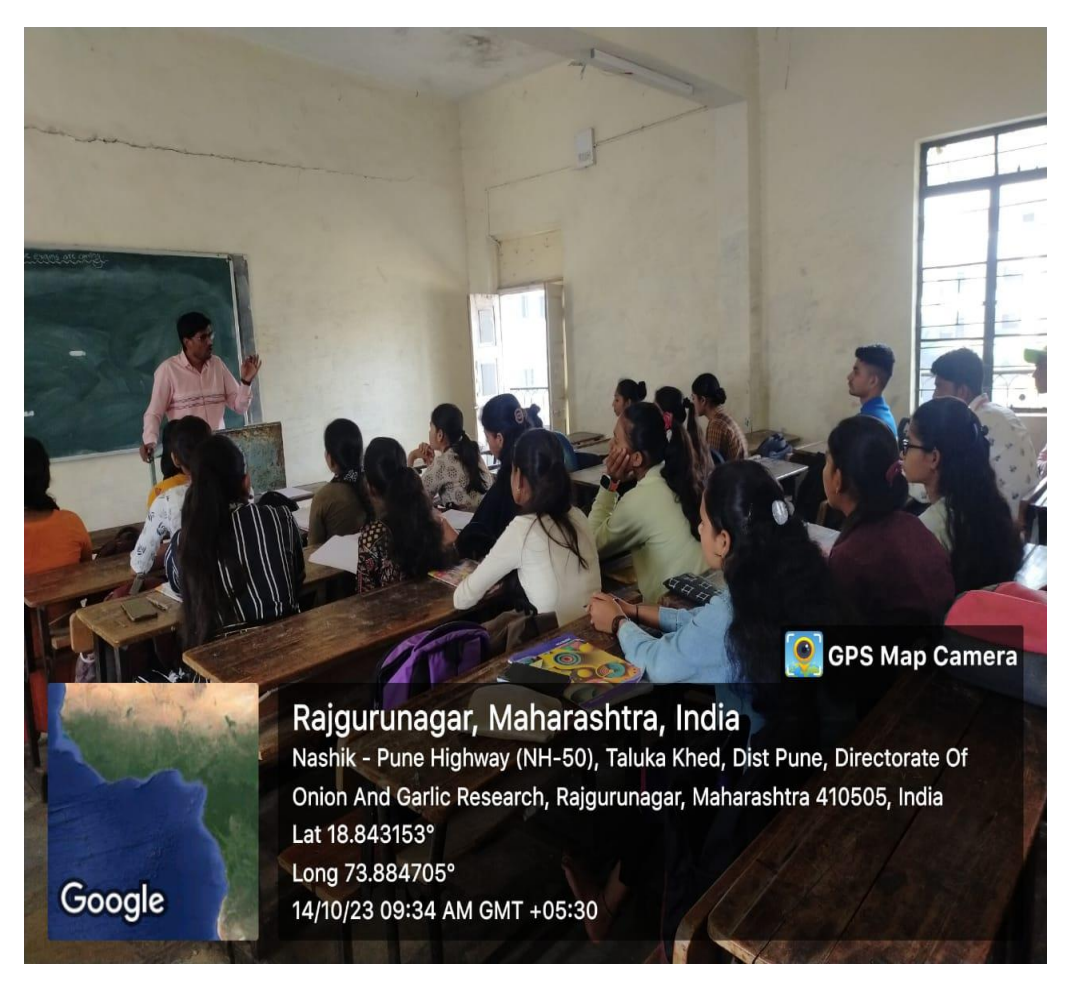
Figure 7: Alumni Interaction