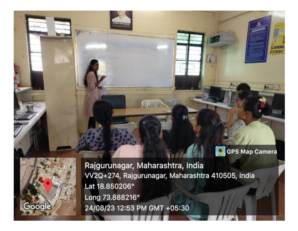
Figure 3: Classroom Seminar