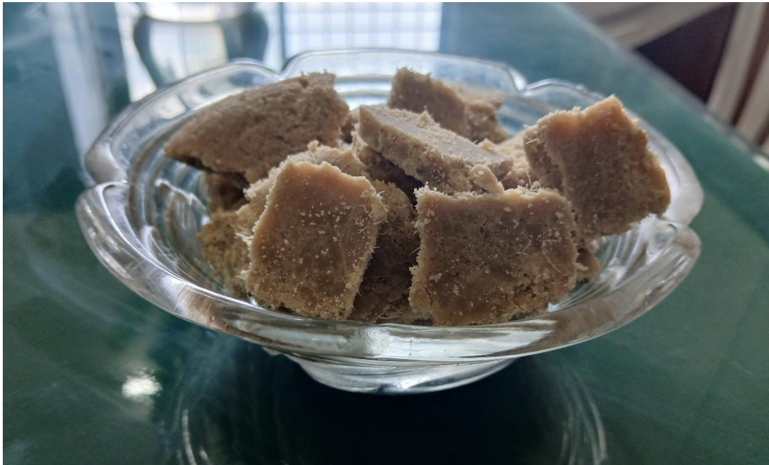
Preparation of Ginger wadi (Ale pak)